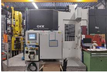
OKK HM X6000