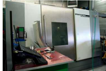
Gildemeister Sprint 65