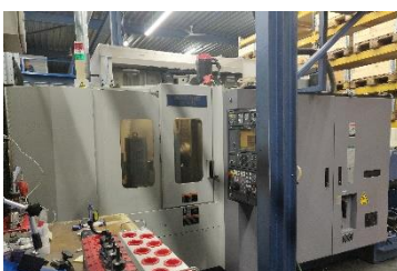
Mori Seiki SH 403