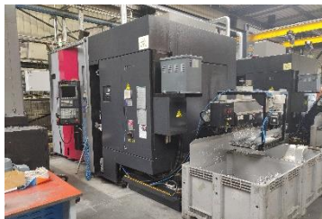
OKK HMC 500