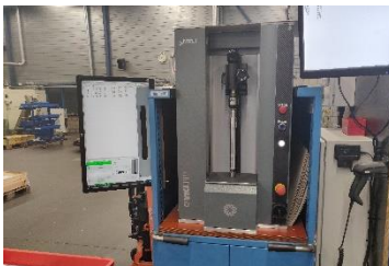
Vici Vision MTL 1