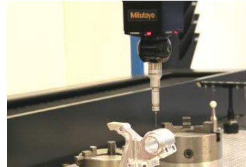
Mitutoyo Crysta Apex C