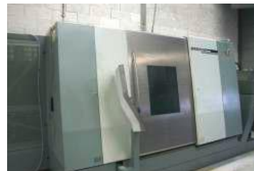
Gildemeister Sprint 65