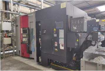
OKK HMC 500