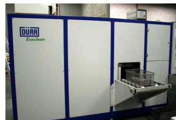
Dürr Ecoclean Cleaning Machine