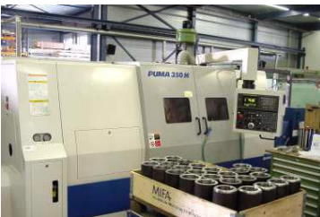
Daewoo Puma 350