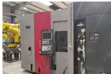
OKK HMC 500