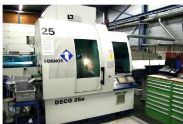
Tornos Deco 26