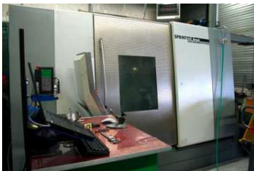
Gildemeister Sprint 65