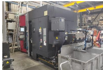
OKK HMC 500