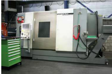
Gildemeister Sprint 65