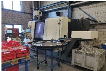
Gildemeister Sprint 65