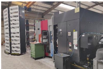
OKK HMC 500