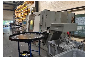
Gildemeister Sprint 65