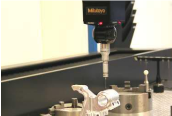
Mitutoyo Crysta Apex C