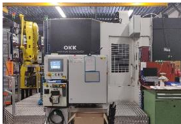
OKK HM X6000