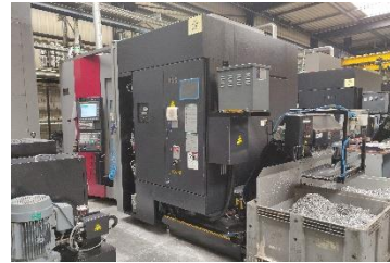
OKK HMC 500