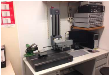
Mahr Marsurf XC 2